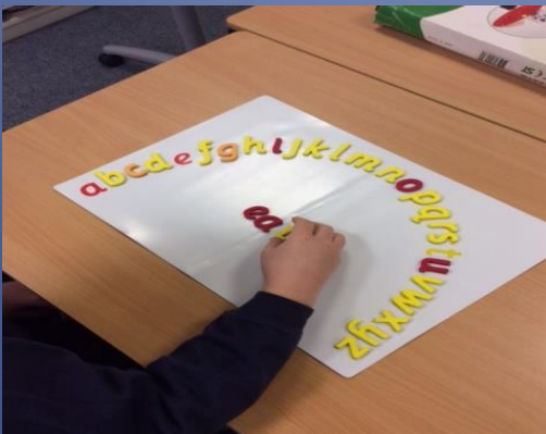
1:1 phonics – Rainbow Arc