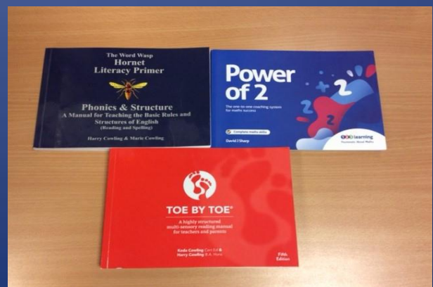
Precision teaching interventions