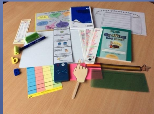
Resources to support lessons